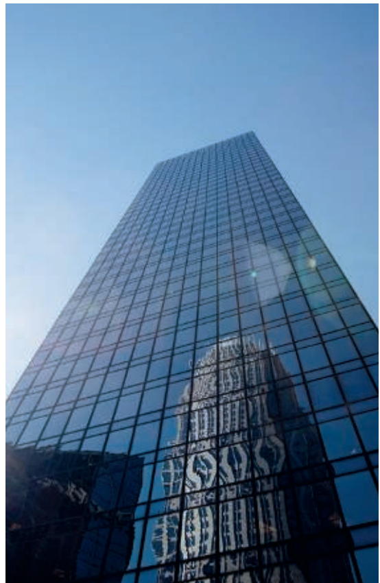
Charlotte office / North Carolina, USA – certified LEED O&M GOLD