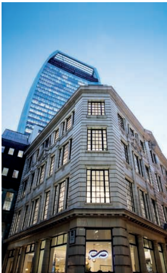
London office / United Kingdom – Certified BREEAM