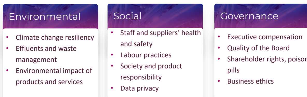
Figure 3. Thematics AM ESG Criteria

Aligned with the aim of the risk management-targeted engagement, our priority is for companies to demonstrate transparency primarily on material ESG metrics. Transparency on these metrics in turn enables a well-informed ESG performance assessment. Material risk metrics are those that companies in our funds are most exposed to, linked to the nature of their activities. The diagram below indicates the 11 metrics on which we will engage with companies.